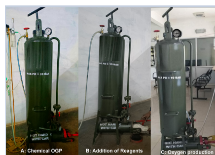
Figure 3: Plant in use: A-Prototype plant; B-Chemicals being fed : C-O2 being produced