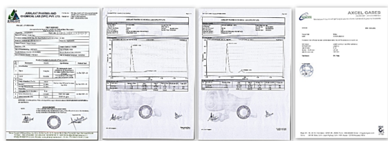
Figure 4: Oxygen purity certifications