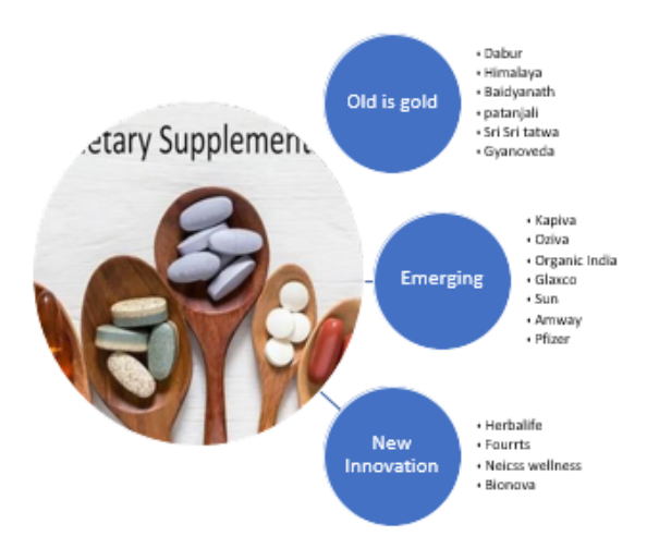
Figure 1: Availability of dietary supplements