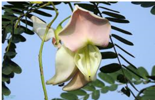
Fig. 1: Sesbania grandiflora